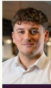
Co-written by Drilon Baca Economist

30 years experience in providing insightful market analysis and forecasts on UK construction and the built environment that can inform companies' business development and market strategies.