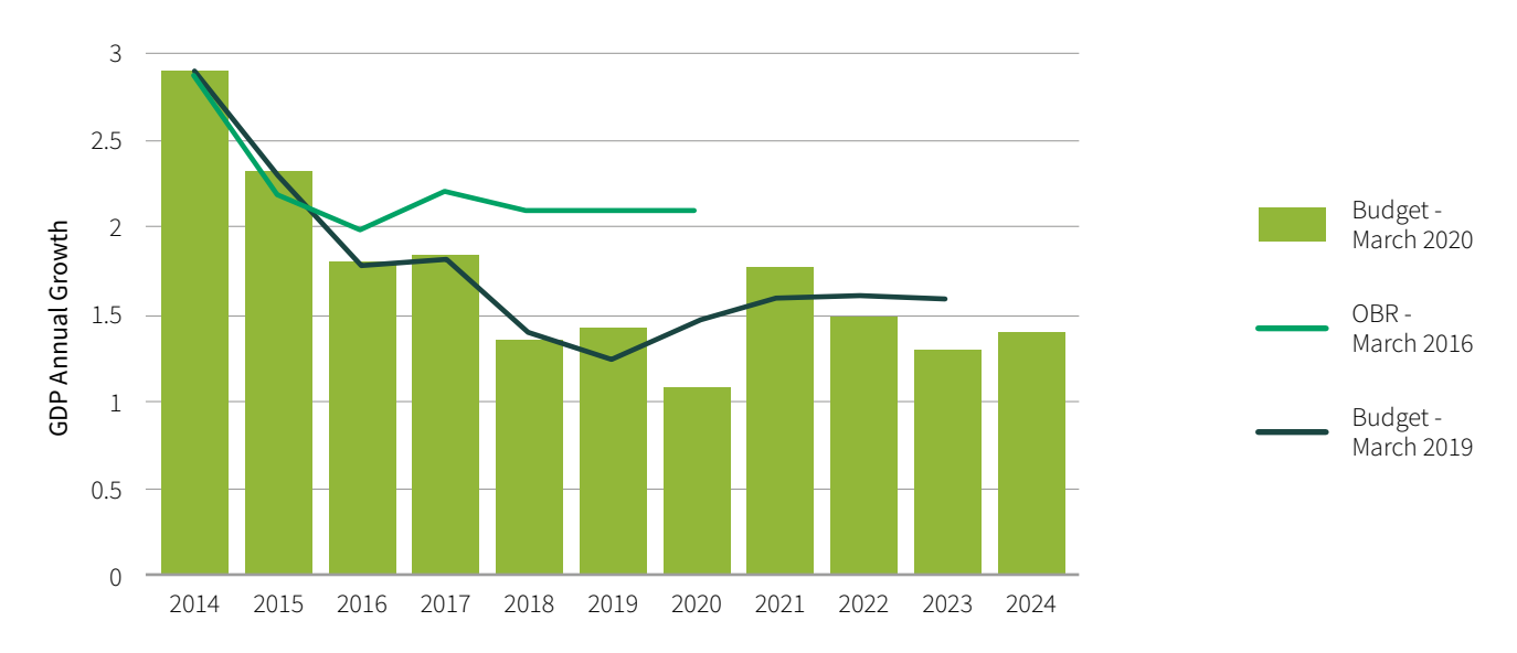
Chart 1: UK economy forecast